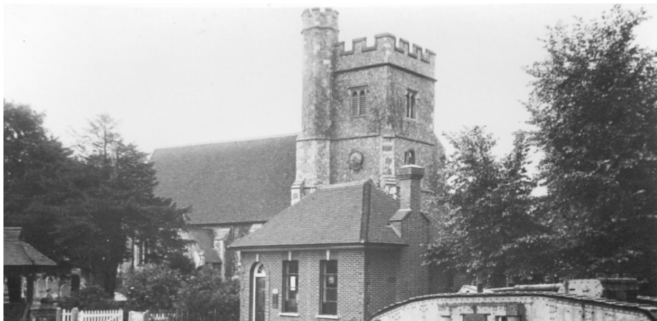
Farningham tank in the 1930s. The bank (then Martin's Bank, later Barclay's) was built in 1922. The tank was taken as war scrap in 1940. Sadly, the bank has closed this year and the building is up for sale.